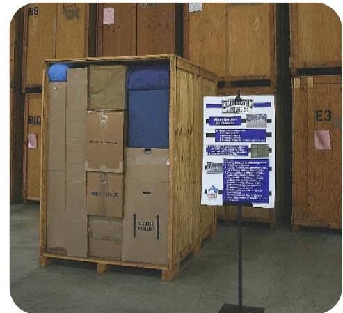
This is an example of how your items will be containerized & stored for the summer.