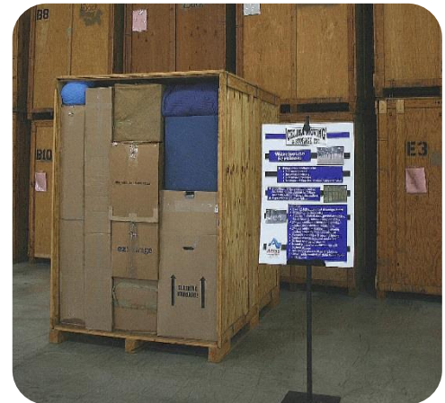
This is an example of how your items will be containerized & stored for the summer.